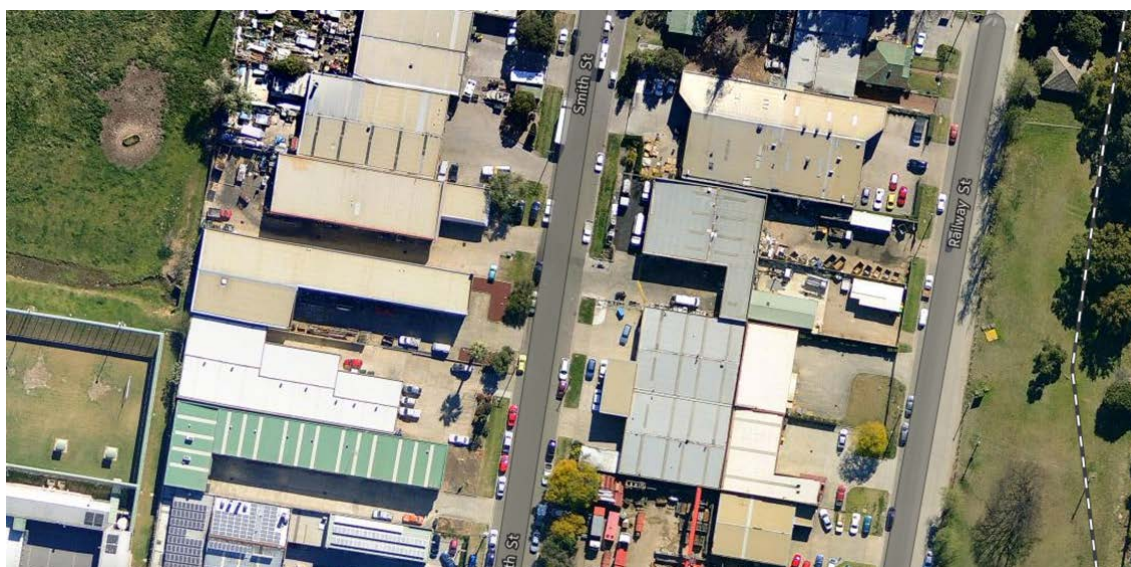
Figure 1: Locality Plan

The surrounding area to the north-east of the site is operated by Boral Quarries. The area to the north-west contains Emu Plains Correctional Facility. Industrial developments immediately adjoin the site to the north, east and south. The nearest residential area is approximately 350m south-east of the site, however, there are a number of residential properties located within the industrial area.